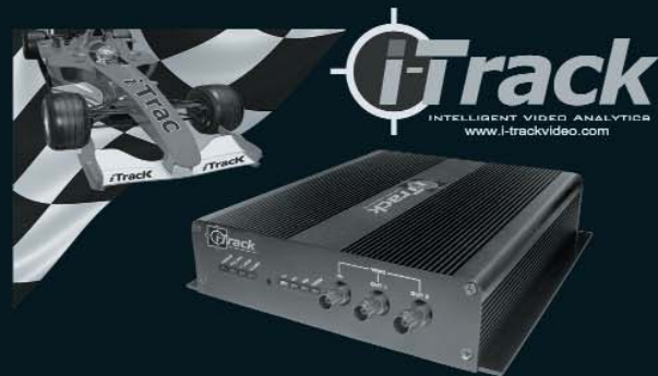
Intelligent Motion Tracking