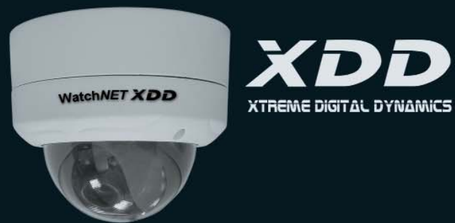
Ultra Hi Resolution Vandal Dome Camera

Canada 351 Ferrier Street, Unit 5 Markham, ON L3R 5Z2 Toll Free: 1-866-843-6865 Tel: 416-410-6865 Fax: 1-866-331-3341