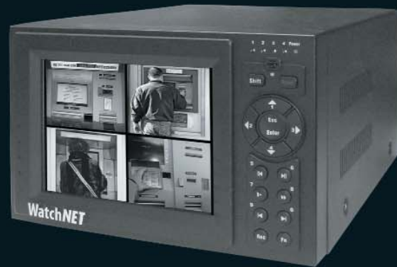
Real Time Stand Alone ATM DVR