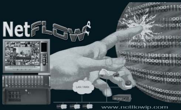
Megapixel NVR Hybrid Scalable from 4 to 64 Channels