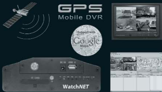
Mobile DVR with Real time GPS Tracking/Viewing