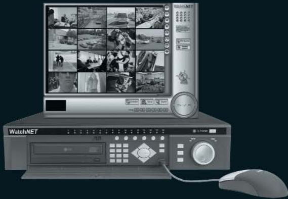
Embedded 8TB DVRs, CMS & PTZ with Auto Trace Function & POS Integration