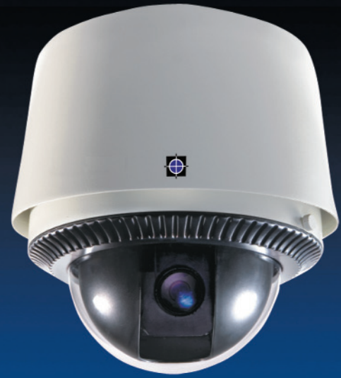
HCPT-18X-N(P) / HCPT-26X-N(P) / HCPT-36X-N(P)