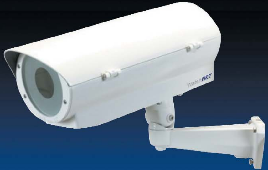
Vandal Proof VOHBC - 6000 Industrial Camera Housing