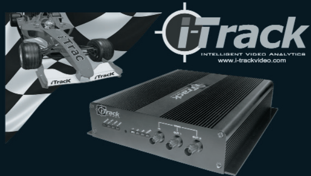
Intelligent Motion Tracking