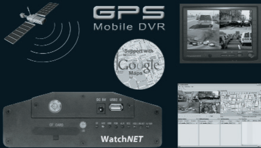
Mobile DVR with Real time GPS Tracking/Viewing