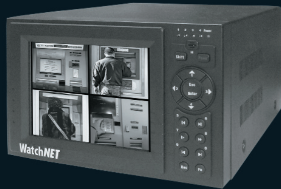
Real Time Stand Alone ATM DVR