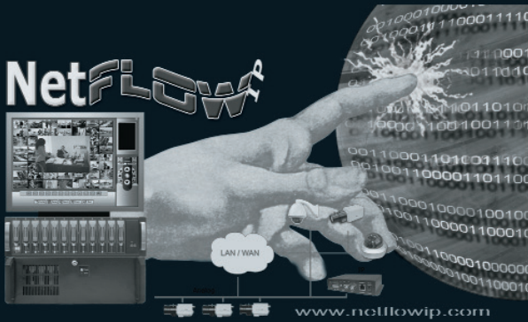
Megapixel NVR Hybrid Scalable from 4 to 64 Channels