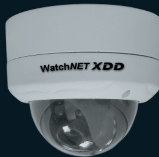
XDD XTREME DIGITAL DYNAMICS