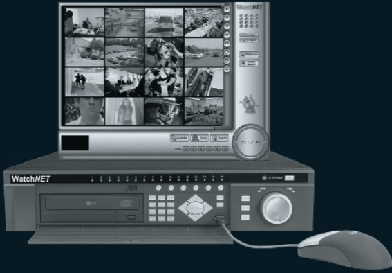
Embedded 8TB DVRs, CMS & PTZ with Auto Trace Function & POS Integration