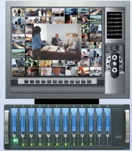
True 64CH NVR IP & MegaPixel