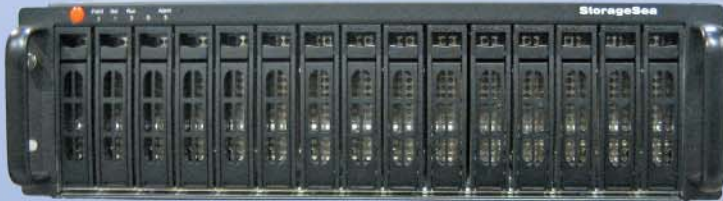
Network Attached storage system