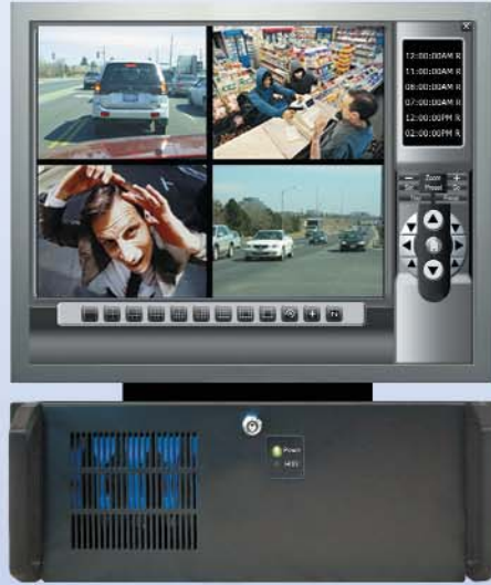
Hybrid N DVR Analog & IP