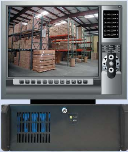
Analog DVR 64CH CIF, 2CIF, D1