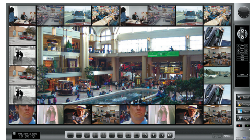
64 HD-NDVR Software / CMS